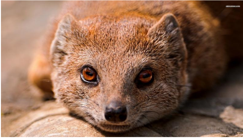
The Mongoose is watching!